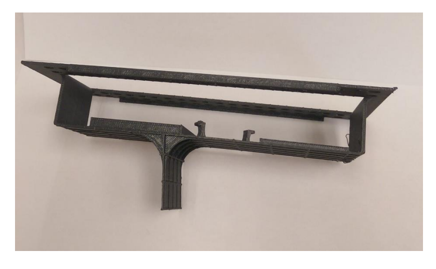
Figure 4: The final Brace iteration with vertical plate and clips for cable management.

The final iteration of the brace included an additional downwards plate to prevent the additional wiring of the Pixhawk module from becoming entangled with and snaring the SuperPup's elevator and rudder servos, also contained within the plane's main compartment, an issue discovered in initial flight testing.