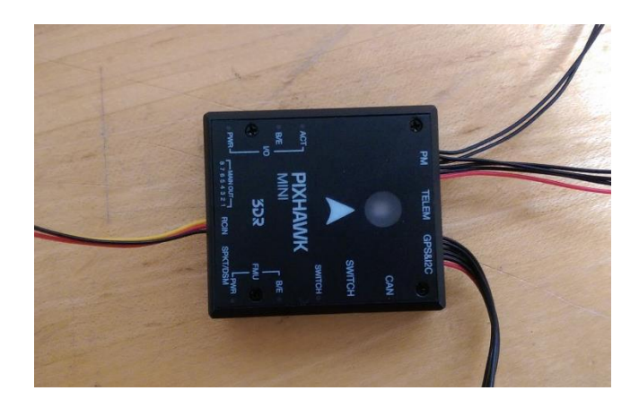
Figure 2: The Pixhawk flight controller.

The internal brace was designed to sit in the central compartment of the SuperPup and to be held in place by the wing. It needed to be light weight and hold a Pixhawk flight controller module and its accompanying GPS module.