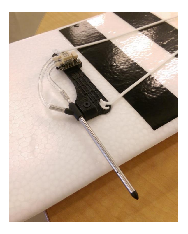
Figure 5: Pitot Airspeed Sensor mounted on wing.

The pitot airspeed sensor was designed following similar light-weighting techniques used for the brace, with the additional challenge of needing to mate with the pre-existing attachment points used for the wing's support struts. It attached directly onto the wing, though could not be removed without cutting the 3D printed piece itself once attached.