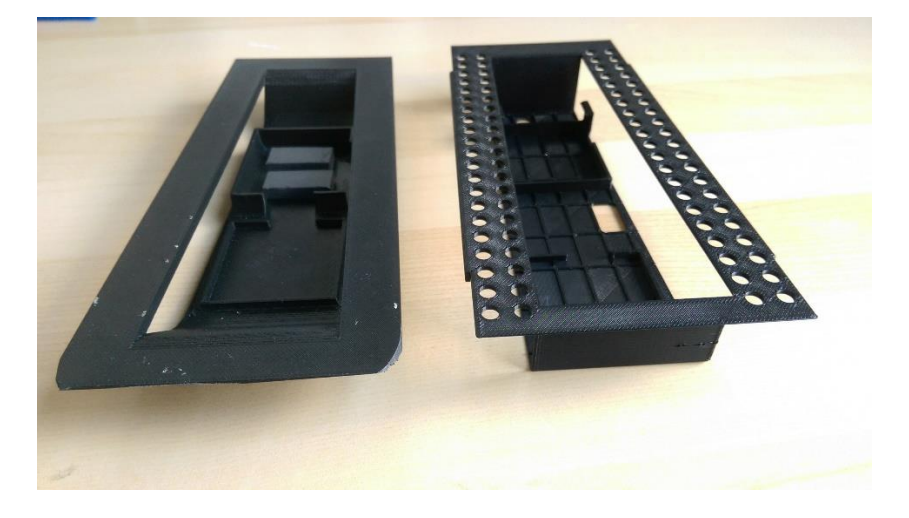
Figure 3: Initial iterations of the brace.

The initial prototype pictured leftmost in the Figure 3, was refined in the subsequent iteration (right) to reduce weight by removing material, whilst resisting bending stresses in the undercarriage holding the Pixhawk and GPS module through the use of supportive longitudinal and transverse beams. This technique was inspired by semi-monocoque wing designs used in aircraft manufacture. Further improvements included designated holes for wire-management.