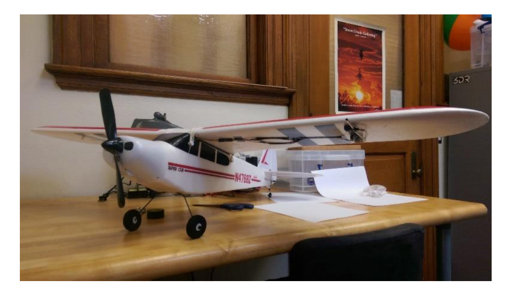
Figure 1: SuperPup with wing-mounted pitot airspeed sensor.

The plane is a commercially available SuperPup RC plane, and was chosen for its quality as a "starter kit" - intended for inexperienced pilots – as well as its portable size. It was modified with the addition of an internal 3D printed brace and external wing mount for a pitot airspeed sensor. The brace holds a Pixhawk flight controller and gps module in place and accommodates the wiring necessary to connect the controller to the rest of the system.